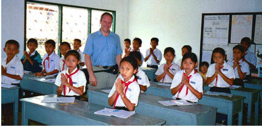
The classroom and students at Wat Siamphone Temple School