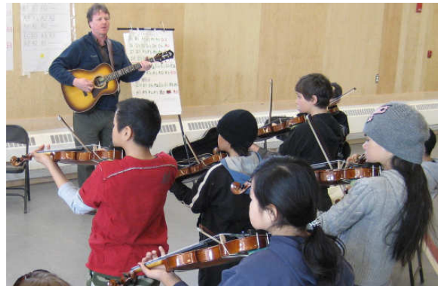
Learning new skills during the 2008 Fiddle Workshop