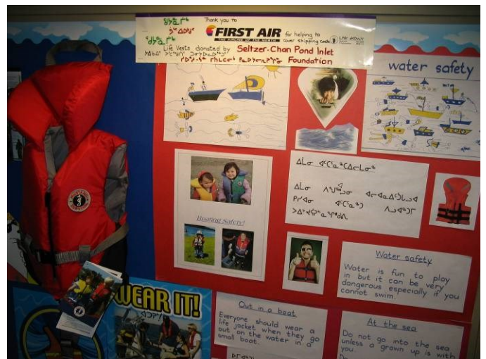
The Boating Safety display in the Nattinnak Centre lobby.

August was Boat Safety Month in Pond Inlet. Colouring and activity books and 38 life-saving vests and suits were provided by the foundation. First Air donated part of the shipping costs.