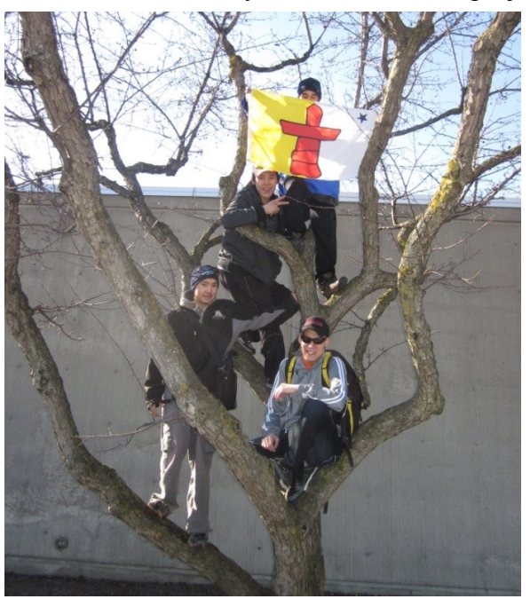
ETP students saw (and climbed) trees for the first time

Students from the Environmental Technology Program (ETP) at Pond Inlet's Arctic College visited biology researchers at Laval University in April, a trip partially funded by the Foundation. Members of the two groups had met last at "Goose Camp" on Bylot Island near Pond Inlet where some of the ETP students had helped apply neck collars to snow geese. The Quebec trip was an opportunity for the students to gain a broader understanding of the scientific and research process and to provide input about involving the Pond Inlet community in future research projects.