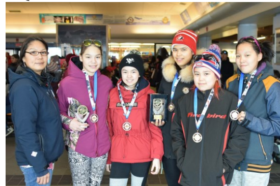
Happy hockey players and their parent chaperone in Iqaluit

This spring five players and a chaperone flew from Pond Inlet to Iqaluit for the Toonik Tyme Female Hockey Tournament . They had lots of adventures in the capital and were great sports. Coach Brady Fischer proudly reports that “...these girls showed heart, determination and pushed their limits.”