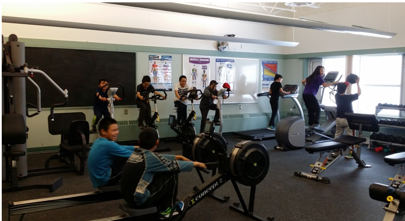
Students, sports teams and community members are making great use of the new exercise room

Nasivvik High School renovated their health and fitness centre this year with funding from the foundation. The fitness centre now has a wide variety of equipment to meet the needs of the school and community. Some new additions include an elliptical machine, two spin bikes, two rowing machines, a power cage, a dip machine and full sets of medicine balls, kettlebells and dumbbells. Posters explain proper techniques and safety concerns. The centre gets extensive use during physical education classes and is used for after-school programs and by community teams. We believe the centre will promote long-term physical fitness and healthy lifestyle choices in the school and community.